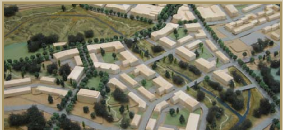
Model of Somerville Landfill Mixed - Use Development