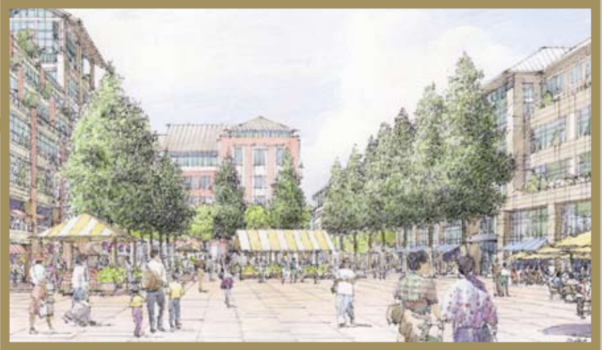
Rendering of the Somerville Landfill Development

The Sleep Disorders Institute will be a major component of the Center. Sleep disorders analysis and treatment is an initiative of Somerset Medical Center that is national in scope. It is envisioned that the Sleep Disorders Institute component of the Somerset County Life Sciences Center will be know as: