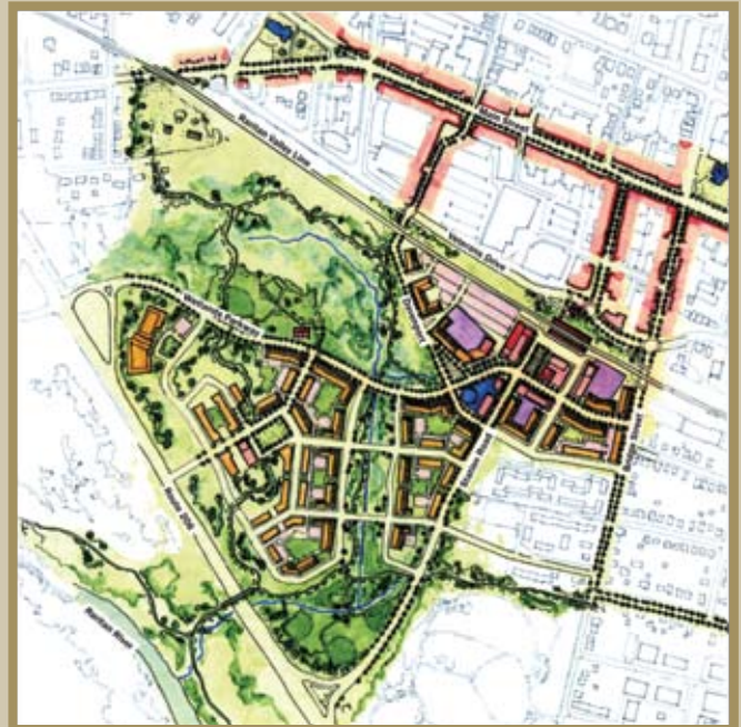
Somerville Landfill Development

The Somerville Landfill site is an 83-acre site in the heart of Somerset County's life sciences market with direct access to the Interstate Highway system and adjacent to the New Jersey Transit rail station. The Vision Plan calls for mixed-use development, including higher density ownership housing, rental housing above ground floor retail, a civic center, office space, and a signature office development that will house the Center.